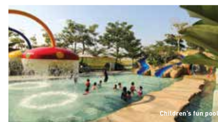
Children's fun pool