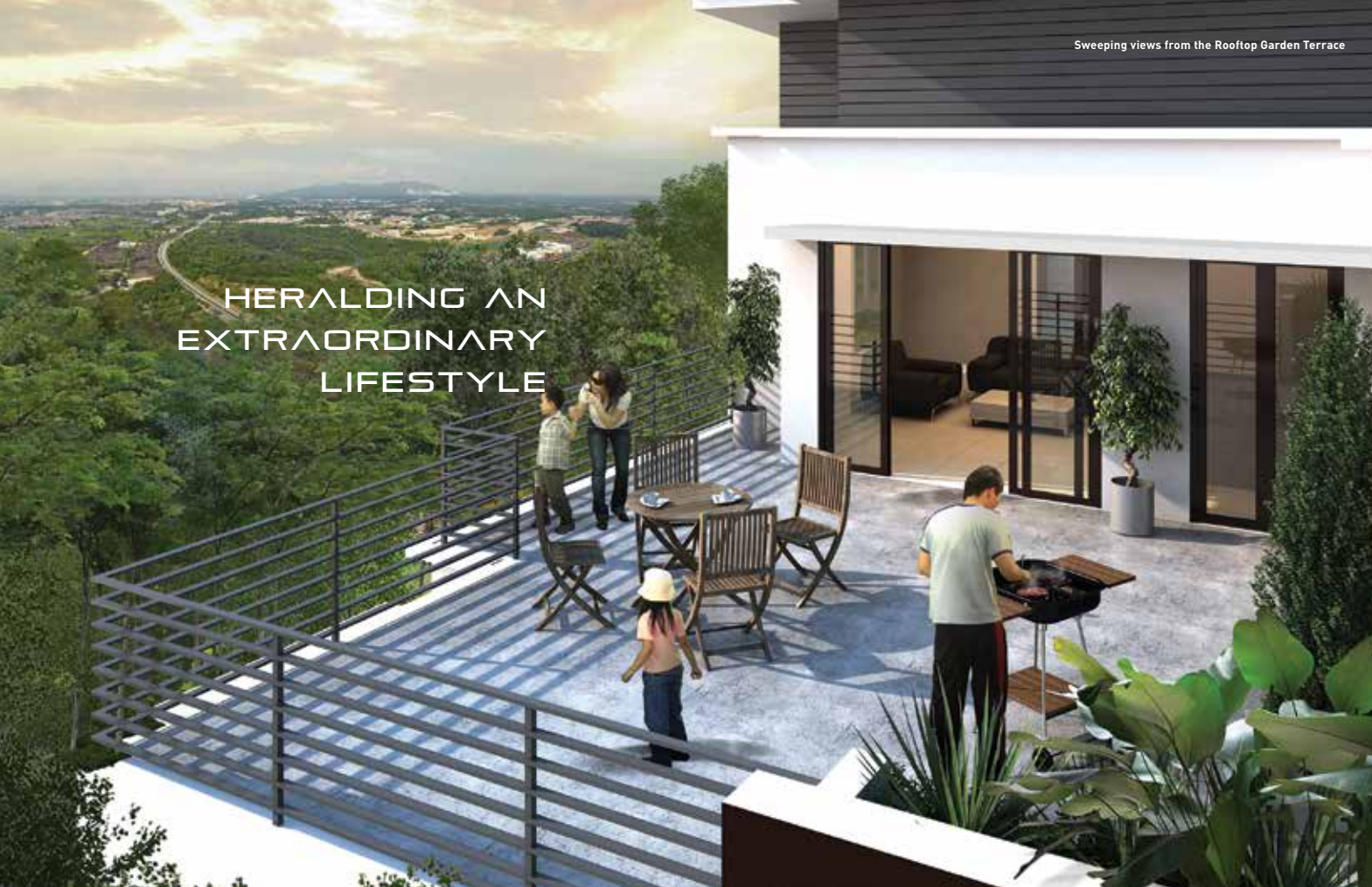
Sweeping views from the Rooftop Garden Terrace