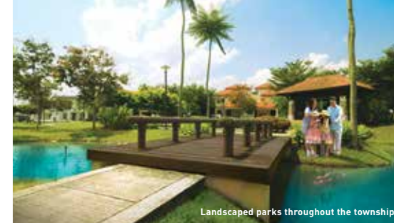
Landscaped parks throughout the township