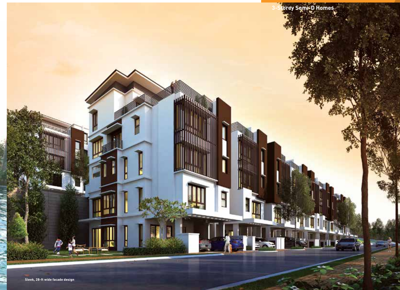
Sleek, 28-ft wide facade design